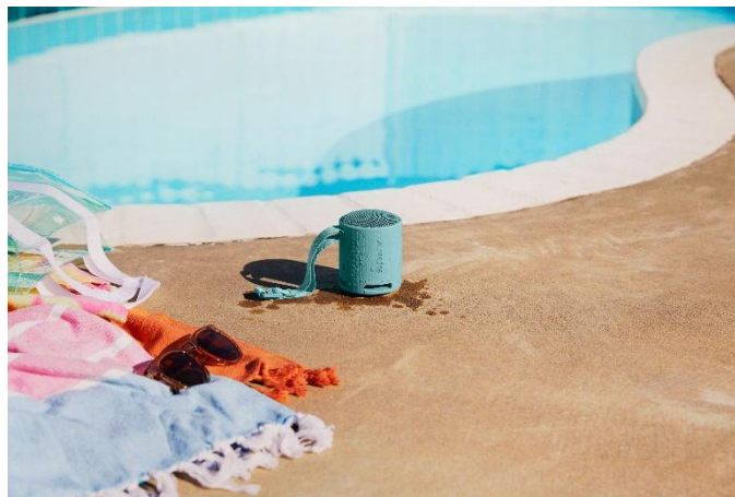
IP67 Rating, Waterproof and Dustproof

The SRS-XB100 speaker is everything you need for life on the move. The speaker includes a passive radiator for powerful sound and offers clear sound even at high volumes thanks to the off-centre diaphragm. Don't be fooled by its compact shape, this little speaker packs an impressive wide spreading sound. The Sound Diffusion Processor expands sound in any space, with its DSP technology.