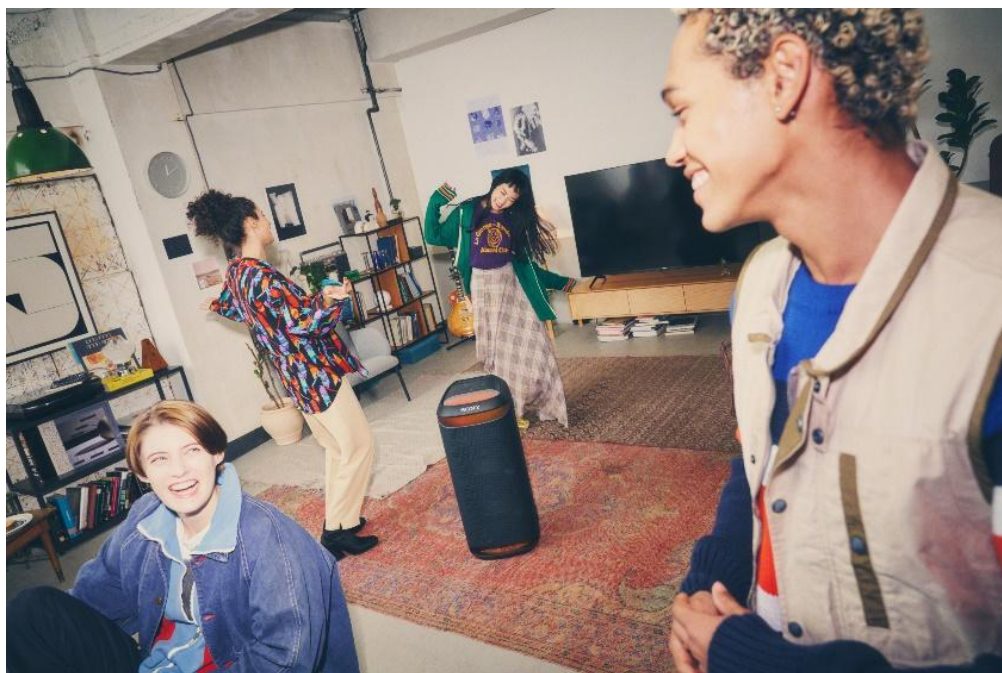
Omni-directional Party Sound

Life should be lived at full volume. That means getting your friends together, turning up the music to full volume and dancing all night to clear, rich sound. The SRS-XV800 features Omni-directional Party Sound that carries powerful sound to every corner of the room. Five tweeters deliver clear sound to both the front and rear of the speaker 1, 2 . Plus, it's all backed up with punchy bass you can feel, thanks to dual X-Balanced Speaker Units.