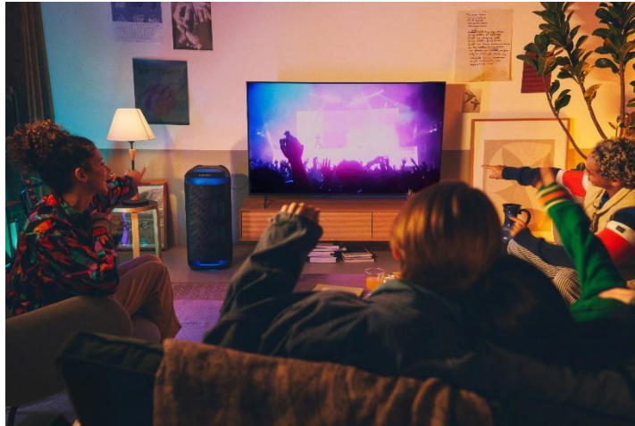
TV Sound Booster

A combination of TV sound and the SRS-XV800's two rear tweeters and X-Balanced Speaker Units boost your TV watching experience by enhancing the deep bass and realistic high-frequencies. The sound waves bounce off the walls to surround you with sound. The TV Sound Booster function 5 lets you enjoy the enhanced sound of audio-visual contents, such as live performance videos and movies, and immerses you in everything you're watching.