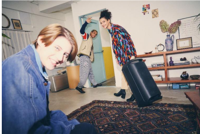
Convenient carry handle

With a built-in battery of up to 25 hours of listening time 3 , the SRS-XV800 will keep the music going all night. If you find your speaker running out of battery, there's no need to worry. With the speaker's quick charging, you can get up to 3 hours of playing time from just 10 minutes of charging.