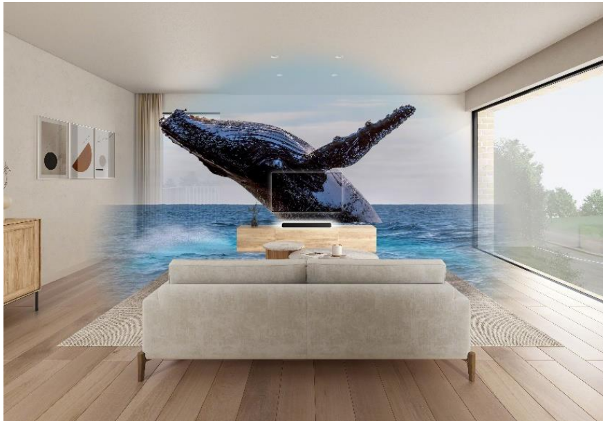
Three-dimensional surround sound

With Vertical Surround Engine and S-Force PRO Front Surround, the HT-S2000 creates cinematic surround sound that lets consumers enjoy the thrill of Dolby Atmos and DTS:X. With Sony's virtual surround technology, the soundbar can position sound in vertical space. S-Force PRO virtually reproduces the surround sound field, with audio coming from both sides. Entertainment lovers can enjoy rich, cinematic surround sound without cluttering their living space.