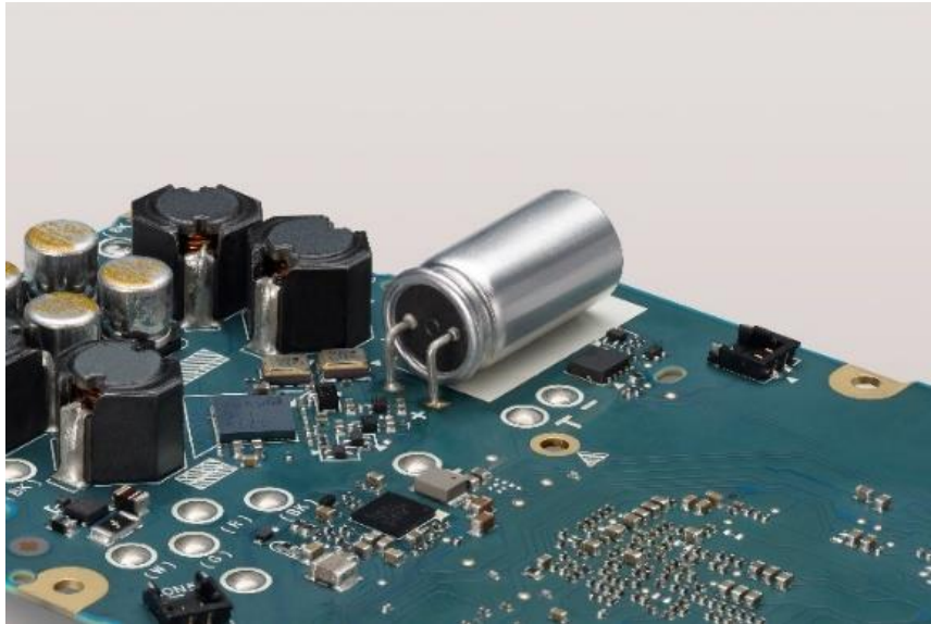
High polymer capacitor and large 8mm coil for balanced output

Inheriting the philosophy of the Signature Walkman®, the NW-ZX707 has upgraded fine-tuned capacitors with a FTCAP3 (High polymer capacitor) and a large solid high polymer capacitor which offers large capacitance and low resistance. While an OFC milled block covering the digital block, allows the NW-ZX707 to bring listeners sound that appears to rise-up from silence. Additionally, a large 8mm coil for balanced output creates an improved sound resolution across all frequencies. All four kinds of components stated here are also used in the latest Signature Walkman® model.