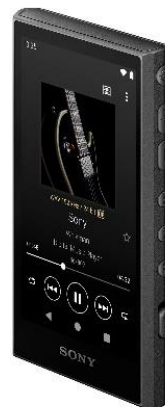
NW-A306 in Black

SYDNEY, AUSTRALIA 11 January 2023 – Sony today announced two new music players, the NW-ZX707 , and the NW-A306 to the Walkman® series family. Both players are designed for listeners to enjoy music the way the artist intended with high-quality sound and a sleek design.